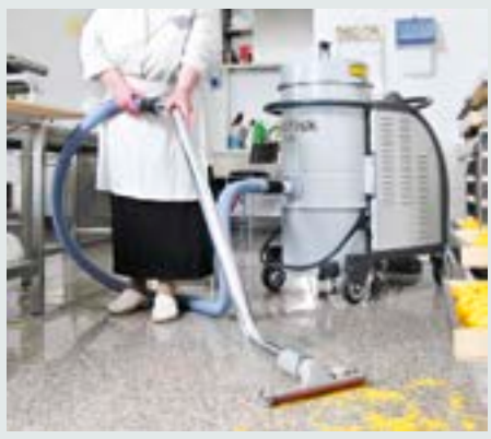
Collection of pasta, flour and sugar