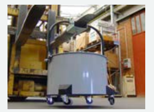
Container transport and discharge system with lift truck