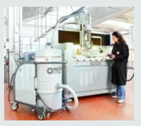
Recovery of shavings from marble carving