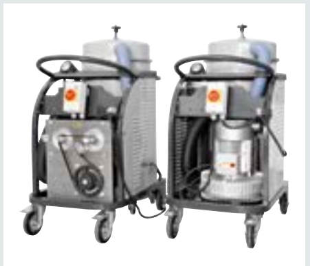
Turbine or lateral channel vacuum unit