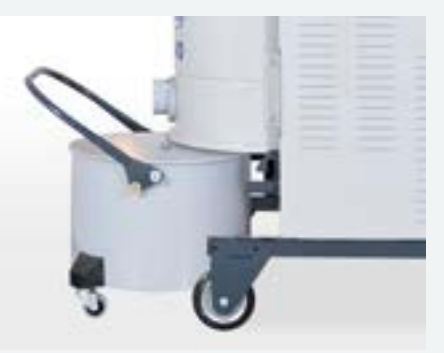
Container release system